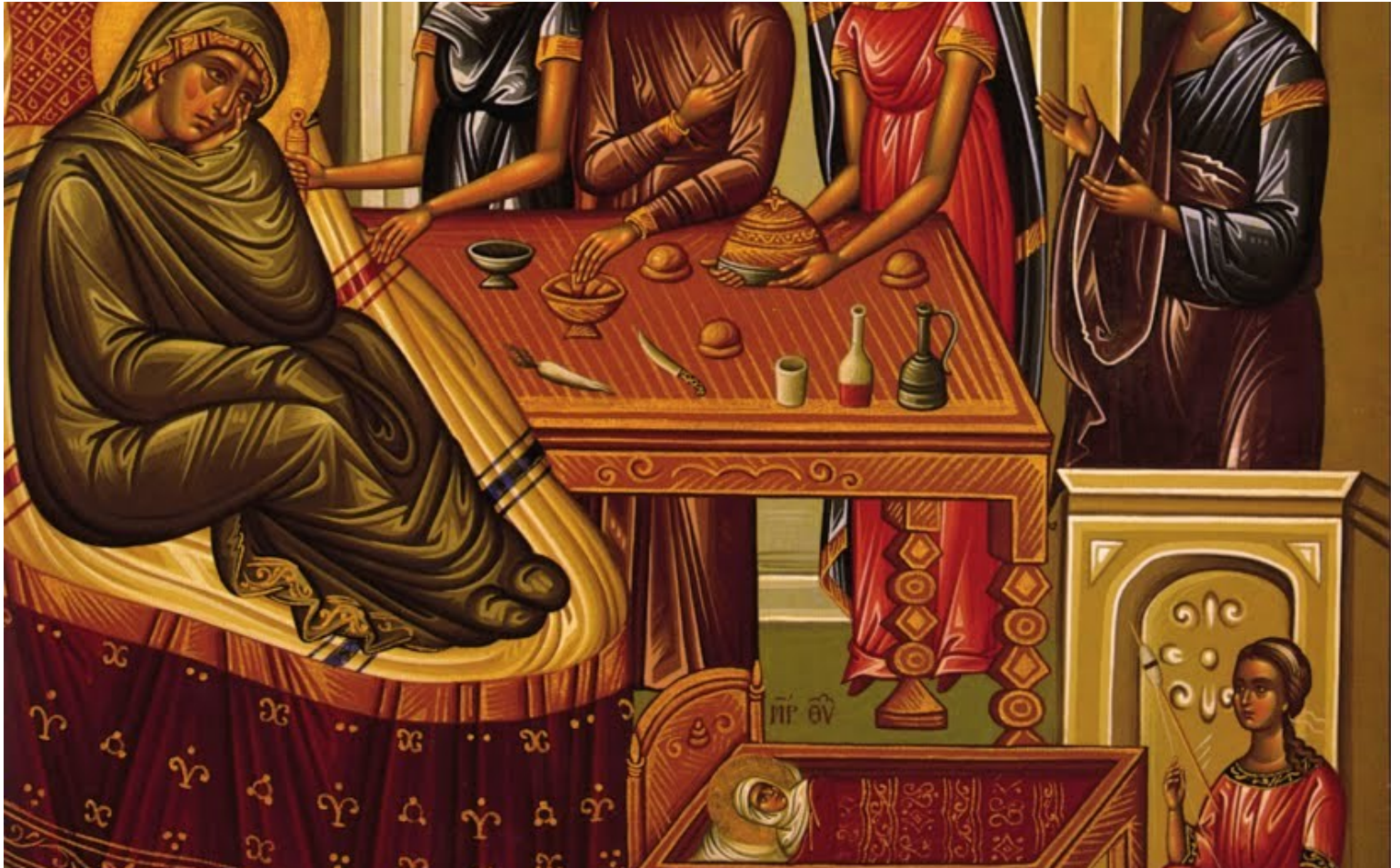
(Above, Nativity of the Theotokos)