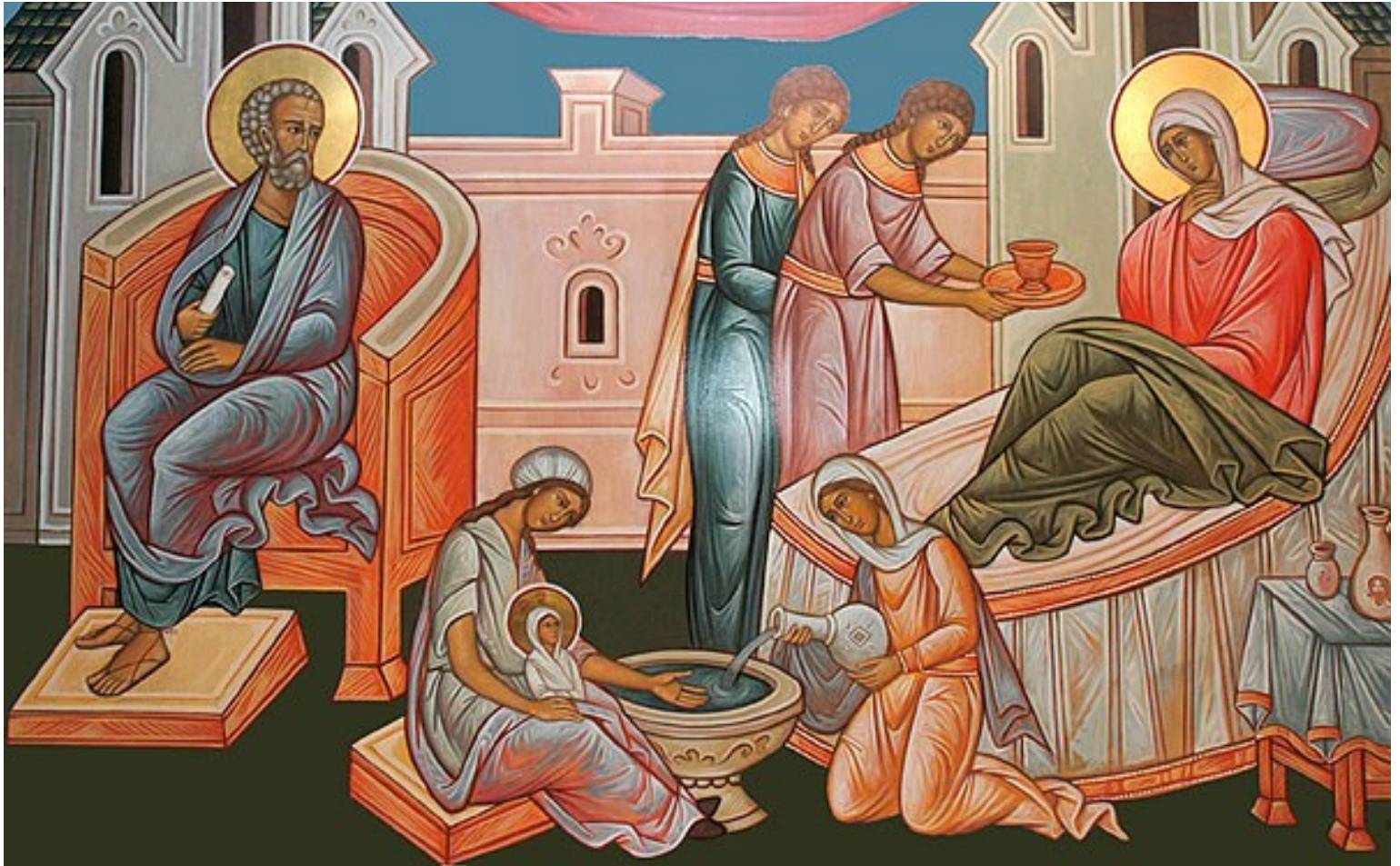
(Above, Nativity of the Theotokos)